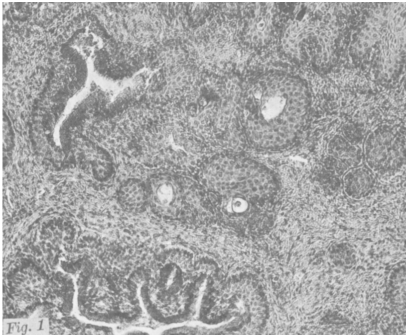
Monkey 11. Section of cervix from ovariectomized animal that received only hormone injections. No cervical trauma given. Shows a close approximation to established cancer, especially the very atypical cells.

Monkey 11. (Fig. 1). "Much papillary gland overgrowth, much epidermization, much infection, many areas of distinctly atypical